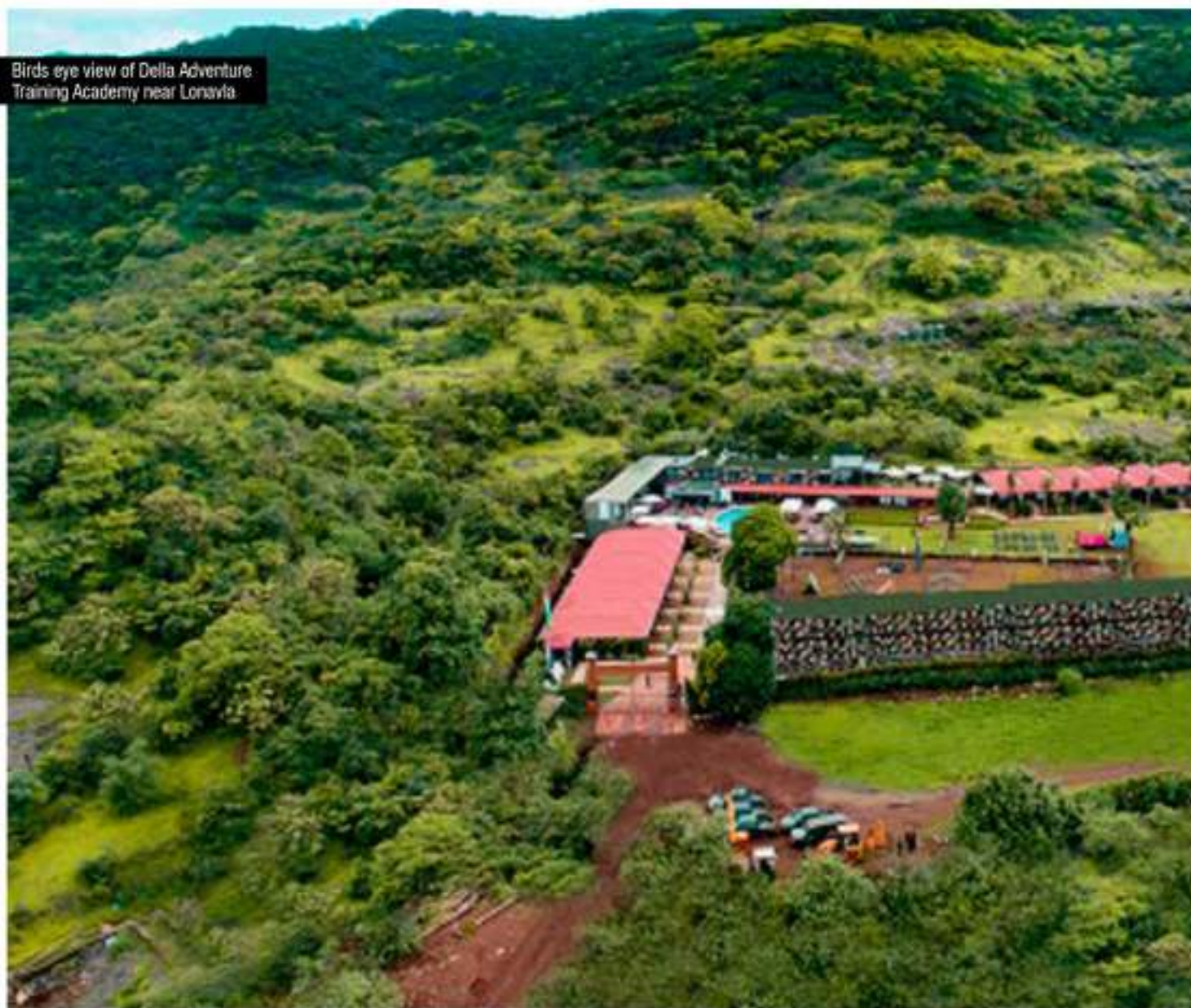
Birds eye view of Della Adventure Training Academy near Lonavla.