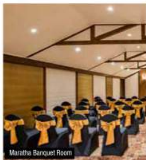
Maratha Banquet Room