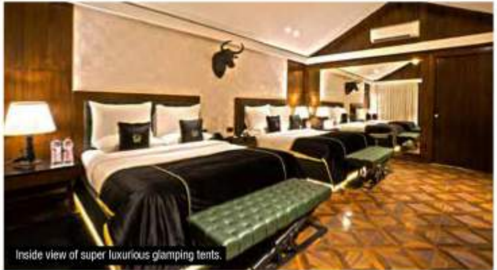
Inside view of super luxurious glamping tents.