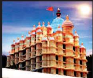
Architect Jimmy Mistry (right) made a presentation on Wednesday showing how Siddhivinayak temple would look once it is illuminated. The project will be completed in the next three months