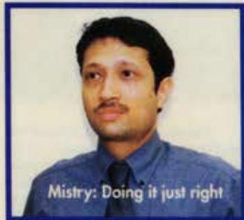
Mistry: Doing it just right

There is also an equally strong emphasis on egalitarianism which is emerging. "Executives today prefer using the same materials for their